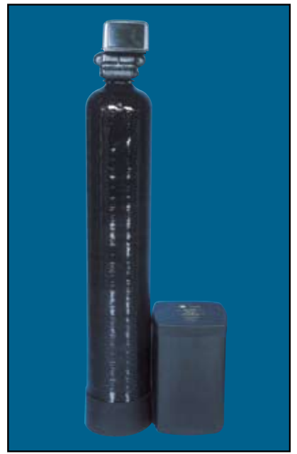
Conventional iron filter using manganese greensand and potassium permanganate as an oxidizer to remove iron and small amounts of sulfur.