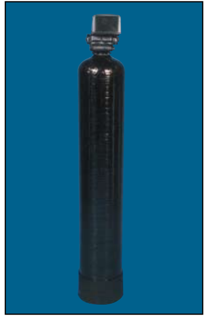
Backwashing filters automatically deliver clean, clear water by removing iron, sulfur, chlorine, tastes, odors, tannins, nitrates, arsenic and many other contaminants.