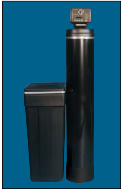
Optional thermal resin tank jacket prevents sweating and provides an attractive appliance-type finish which lasts a lifetime.