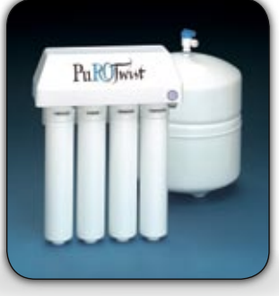
PuroTwist RO (#PT-4000)