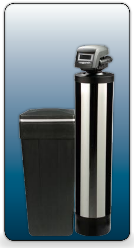
Ultramax Model UM-8100 is pictured in the photo above.

So, don't think Ultramax is just another water conditioner. It is reliable, highly efficient and able to adjust to meet the needs of any family.