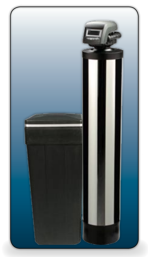
Ultramax Model UM-8150 is pictured in the photo above.